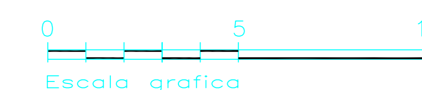
PLANTA 2 E:1:100